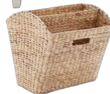
Handy basket Introduce natural colour and texture Magazine basket, £40, Laura Ashley