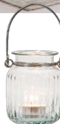
Gentle glow Hang a vintage-style tealight holder Votive, £4.50, Garden Trading