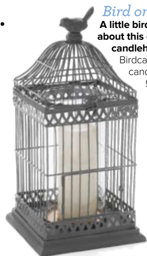
Bird on a wire A little bird told us about this cute cage candleholder Birdcage candleholder, £49, Roost