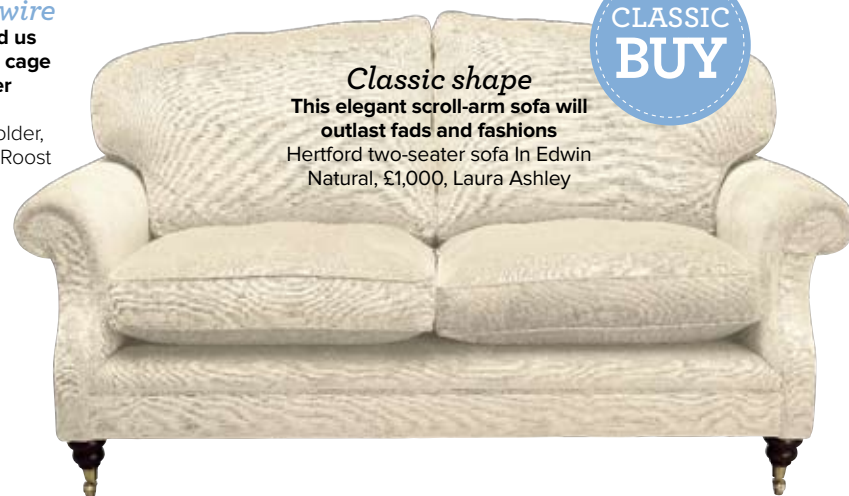
Classic shape This elegant scroll-arm sofa will outlast fads and fashions Hertford two-seater sofa in Edwin Natural, £1,000, Laura Ashley