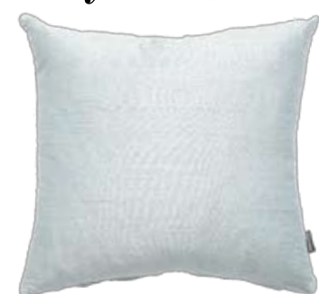
Summertime blues Pile up tactile silk cushions in sun-faded blues Cushion, £20, Heal’s