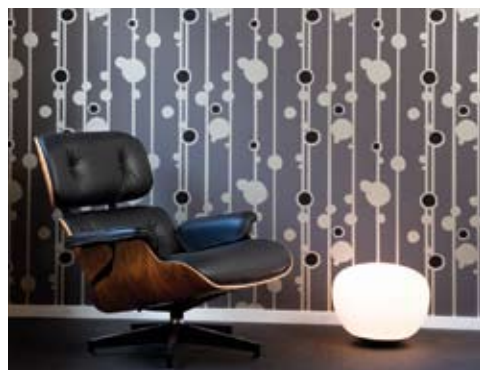
Walldots/ With hints of Sixties futurism, this is a cool alternative to plain stripes. Its easy-hang system makes it ideal for nervous decorators